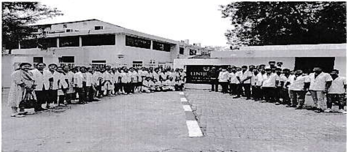
Photo: Industrial Visit at Unijules Life Sciences Ltd.Kalmeshwar (MS)

The students and all staff members have enjoyed the technical endeavour at Unijules Life Sciences Ltd. organizations a lot. The company persons also appreciated our students after the question answer sessions. Visit seems to be very informative and gives good learning experience. Students were well mannered and disciplined throughout the tour. All the staff members and students were extremely thankful to honourable Principal, Officials at organizations who grant the permission of visiting their organization and guide the students.