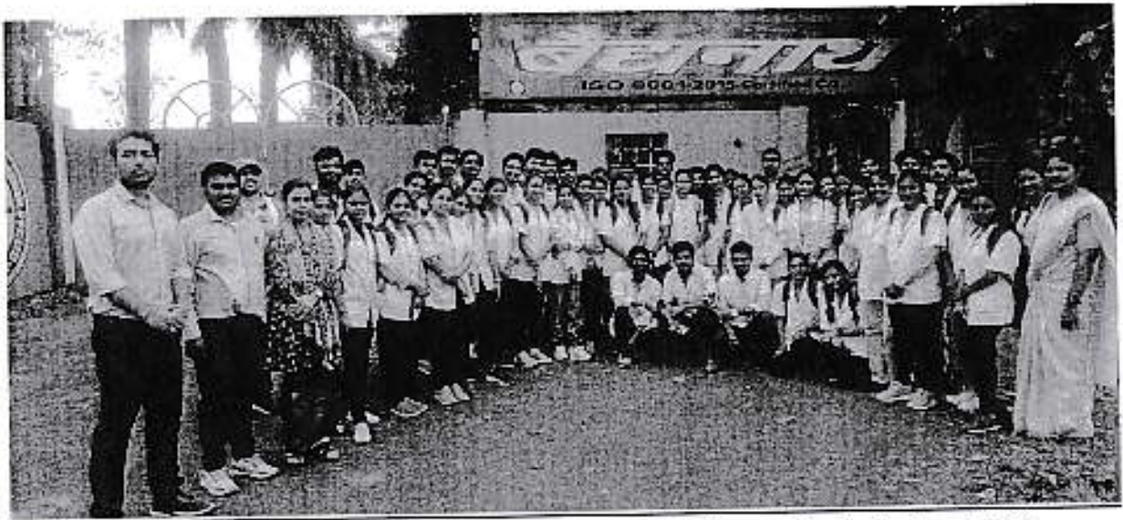
Photo: Industrial Visit at Shree Ayurvedic Bhawan Pvt. Ltd., Seoni (MP)

The students and all staff members have enjoyed the technical endeavour at Shree Baidyanath Ayurvedic Bhawan Pvt. Ltd. organizations a lot. The company persons also appreciated our students after the question answer sessions. Visit seems to be very informative and gives good learning experience. Students were well mannered and disciplined throughout the tour. All the staff members and students were extremely thankful to honourable Principal, Officials at organizations who grant the permission of visiting their organization and guide the students.